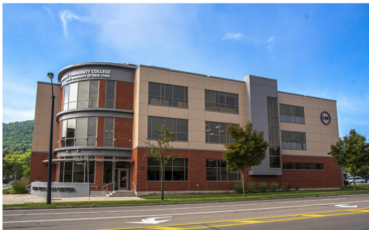
Health Education Center 132 Denison Parkway East, Corning, NY