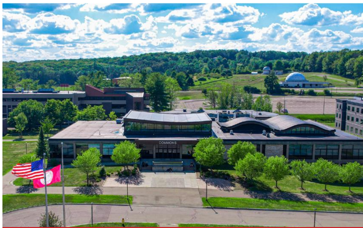
Spencer Hill Campus 1 Academic Drive, Corning, NY

telescope at Mount Palomar; and two kilns, one a hybrid wood-fired ceramics and glass blowing kiln, developed in collaboration with the Corning Museum of Glass and an Anagama kiln, a Japanese-style wood-fired kiln. Three additional locations are the technology facility at Airport Corporate Park in Big Flats, the Academic & Workforce Development Center in Elmira, which includes a welding facility and also houses community service partners; and the Health Education Center, a state-of-the-art complex in downtown Corning designed to serve the educational needs of aspiring healthcare professionals.