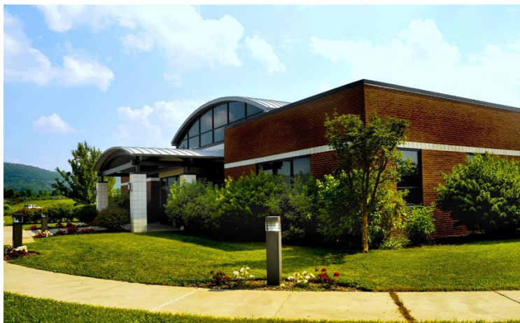
Airport Corporate Park 360 Daniel Zenker Drive, Horseheads, NY