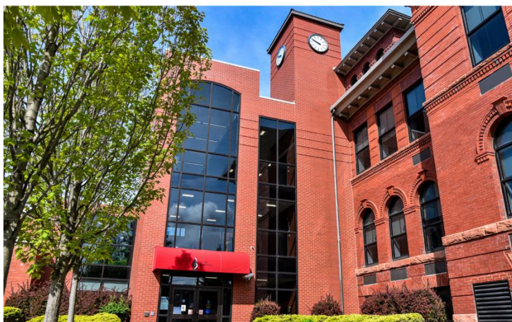
Academic and Workforce Development Center 318 Madison Avenue, Elmira, NY